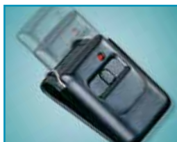
visor clip use to mount transmitter in vehicle