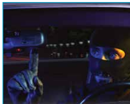
codes cannot be copied