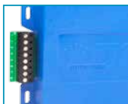
receiver options available to fit specific applications,