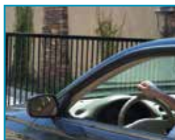
safety/convenience from inside your vehicle